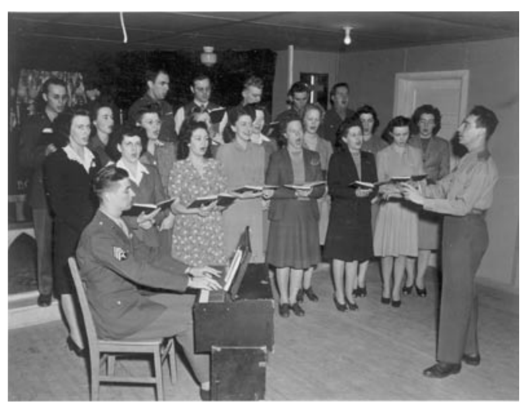
Protestant Chapel Choir.