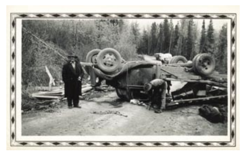
An accident on the Alaska Highway, 1943.