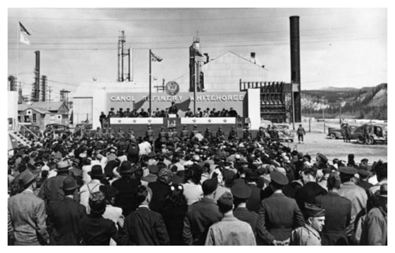
Dedication ceremonies for the Whitehorse Refinery, 1944.